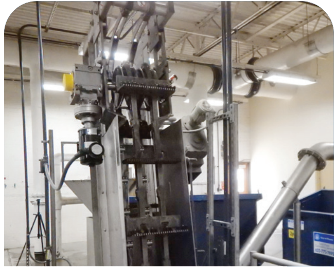
The Aqua Caiman being used in conjunction with Parkson's Aqua WashPress® for dewatering.